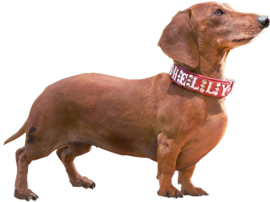
FIG. 3. Wiener dog.

the data to interspecies evolution is questionable. However, we will grant this and continue to analyze the typical case: over a very, very long time the animal gains so many positive changes that it becomes a new species and all Nature's animals, even the silly ones (figure 3), came from that.